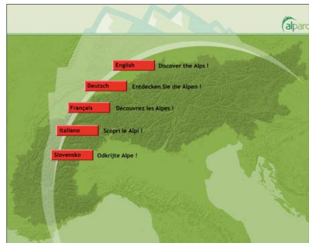
Fig. 2: Welcome page

Entrance is the welcome page (Fig. 2), where users can select a language. All clickable control elements have been designed as buttons, similar to those control elements known from menus of cash points or ticket machines.