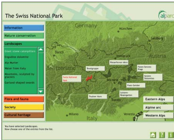
Fig. 4: Selected POI in context menu