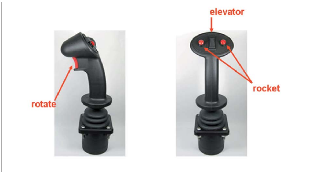
Fig. 6: ViViTo joystick

This rule is not applicable for ViViTo. The application is designed for non-experts.