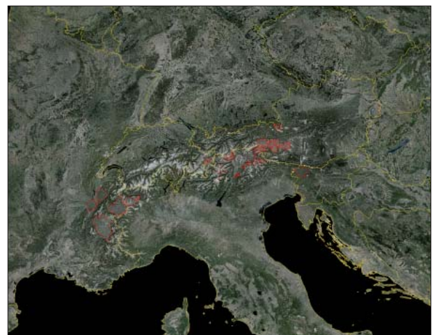
Fig. 3: Overview Alps

While the welcome page is active, an overview of the whole Alps is shown (Fig. 3).